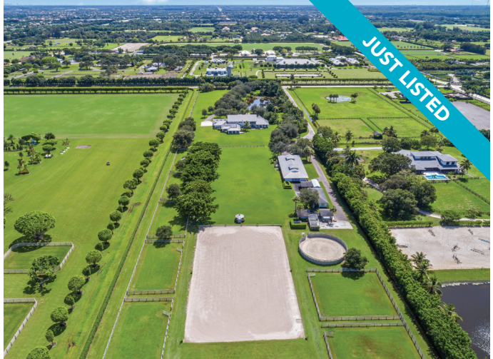
WELLINGTON SOUTH • $8,950,000

Rare Opportunity With Direct Access to Wellington International Showgrounds • Newer Build and Meticulously Maintained on 5+ Acres • 24 Stalls With All-Weather Arena and Grass Field • 6 Large Paddocks and Walker • Owners' Lounge, 2 Offices, 2 Dog Runs • 4-Bedroom Apartment